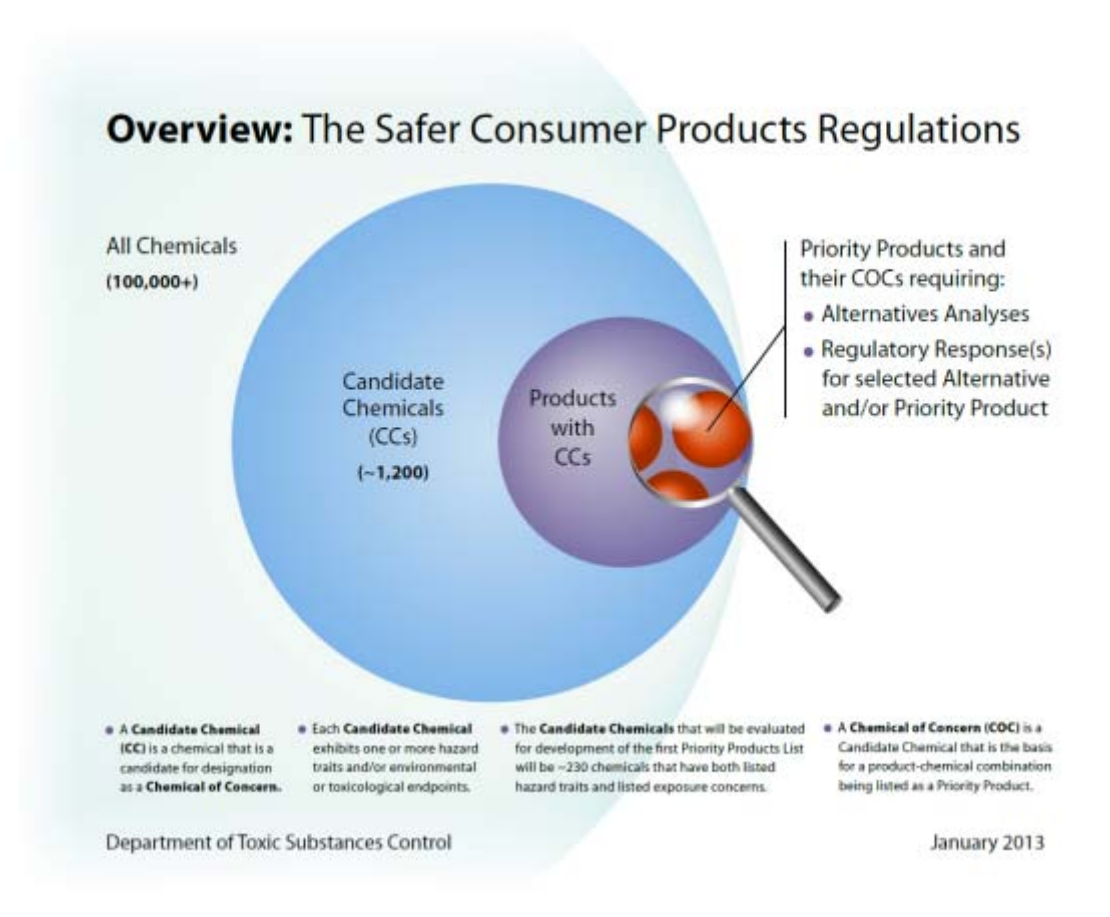
Figure 1 (click image to enlarge)